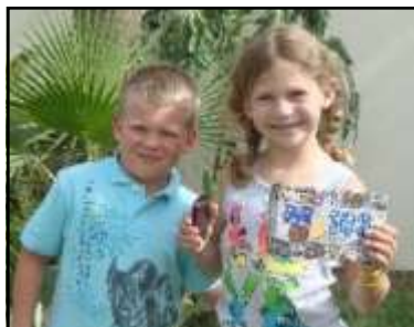
Photos and story submitted by Guider Tanya Murphy, 2nd Witless Bay Guides.